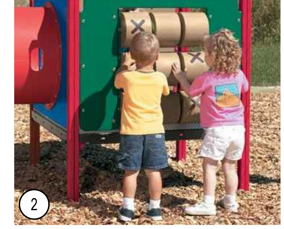
*Conceptual images (provided herein are all subject to change)